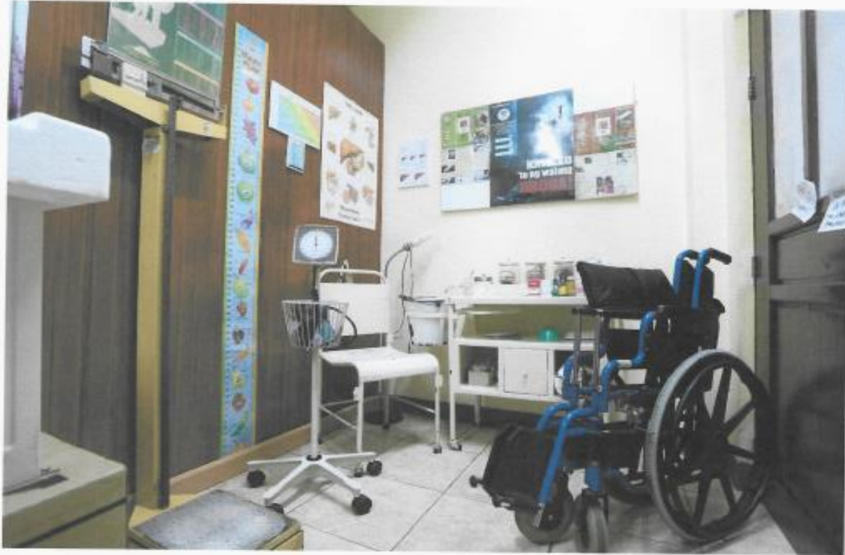
Medical equipment complete and fully ready for emergency purposes