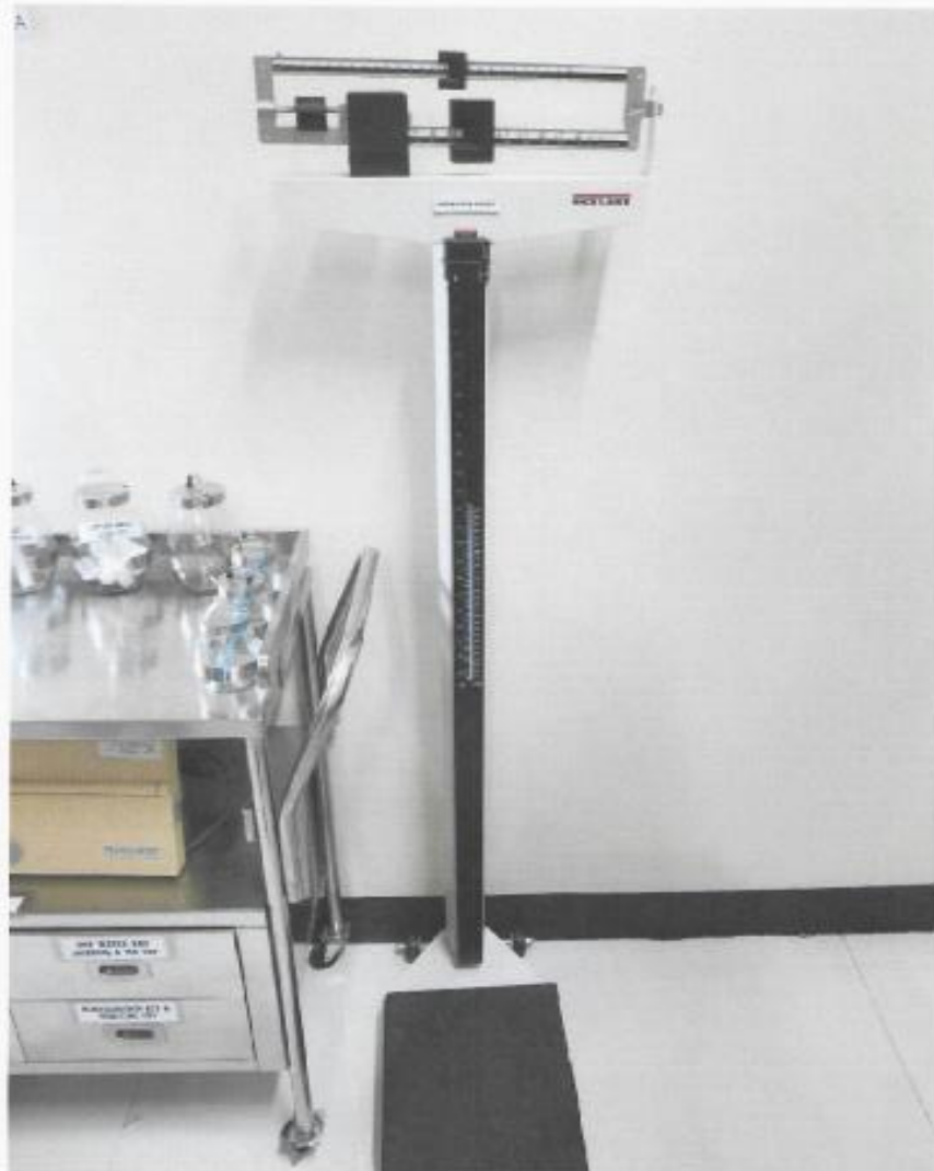
A new and updated patient weighing scale