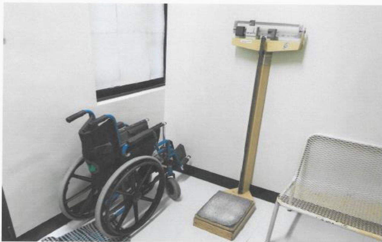
An old patient weighing scale along with a wheelchair